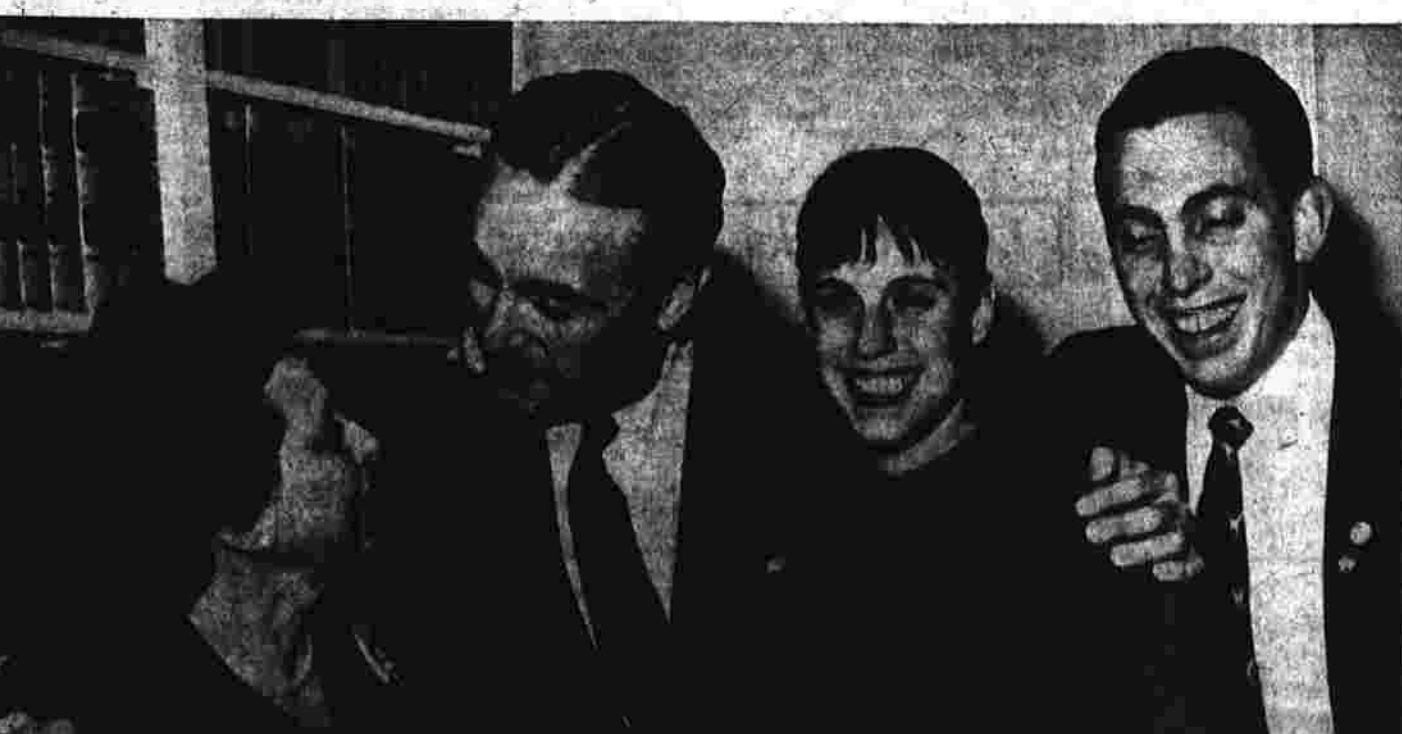
The State's first family rejoices after Gov. Ribicoff learns of his reelection yesterday by a whopping plurality...